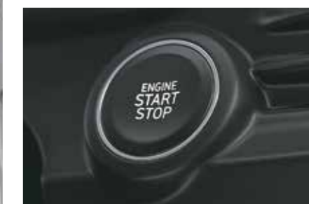
Push button start/stop