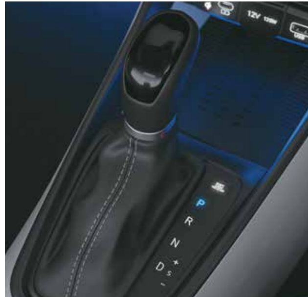
Intelligent variable transmission (IVT)