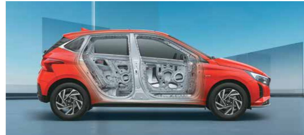
Strong body structure (with AHSS and HSS)