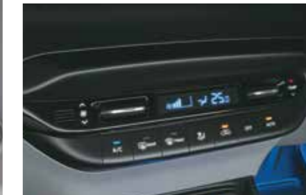
Fully automatic temperature control (FATC)