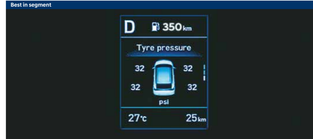
Tyre pressure monitoring system (highline) with display on MID