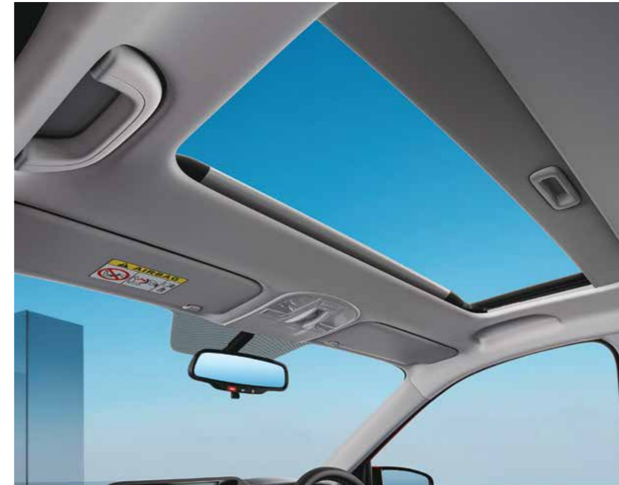
Voice enabled electric sunroof