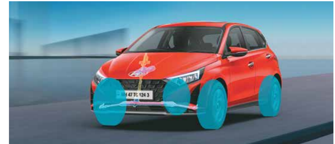
Electronic stability control (ESC) with vehicle stability management (VSM)

Other features: Impact sensing auto door unlock | Speed sensing auto door lock | Automatic headlamps | Burglar alarm | Driver rear view monitor (DRVM) | Emergency stop signal (1 st in segment) 3-point seat belt & seat belt reminder (all seats) | Rear camera with dynamic guidelines | ISOFIX (standard)