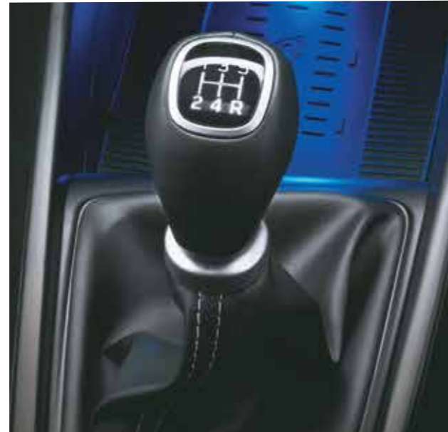
5 speed manual transmission