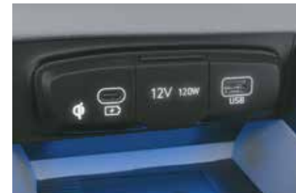
Fast USB charging (Type C)