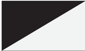
Atlas white with abyss black roof