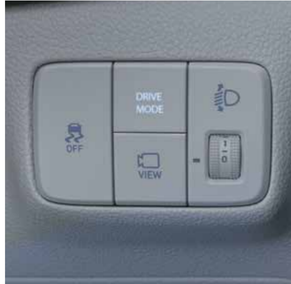
Drive mode select