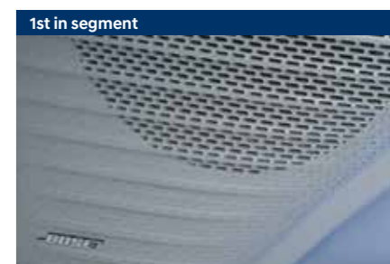
Bose premium 7 speaker system

Other features: 60+ Bluelink connected features (Best in segment) | Multi-language UI support (12 nos.) (1 st in segment) | OTA updates for infotainment and map (1 st in segment) | Home to car (H2C) with Alexa (English & Hindi) | Cruise control | Rear AC vents | Multi phone bluetooth connectivity (1 st in segment)