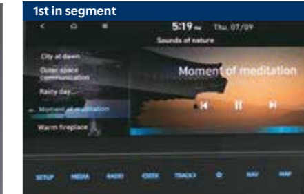
Ambient sound of nature (7 nos.)