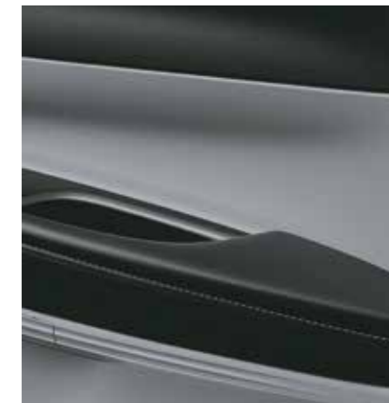
Door armrest covering (artificial leather)